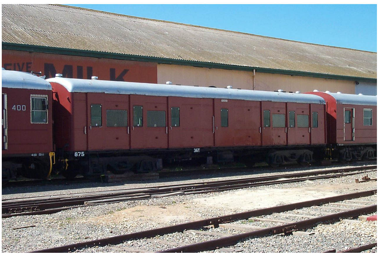
Car 875 at the National Rail Museum

Master 3D design by Malcolm Jenkins, Photos courtesy of Comrails webpage (Chris Drymalik).